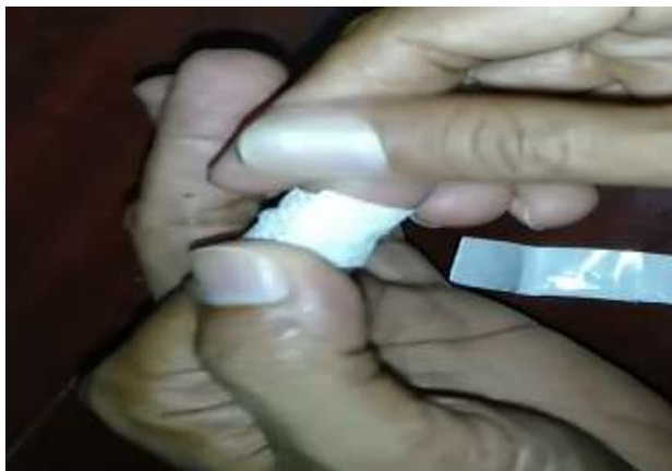
Figure 2: Put seed on the trirangin fixed joint correspondent of fear (joint number 14).