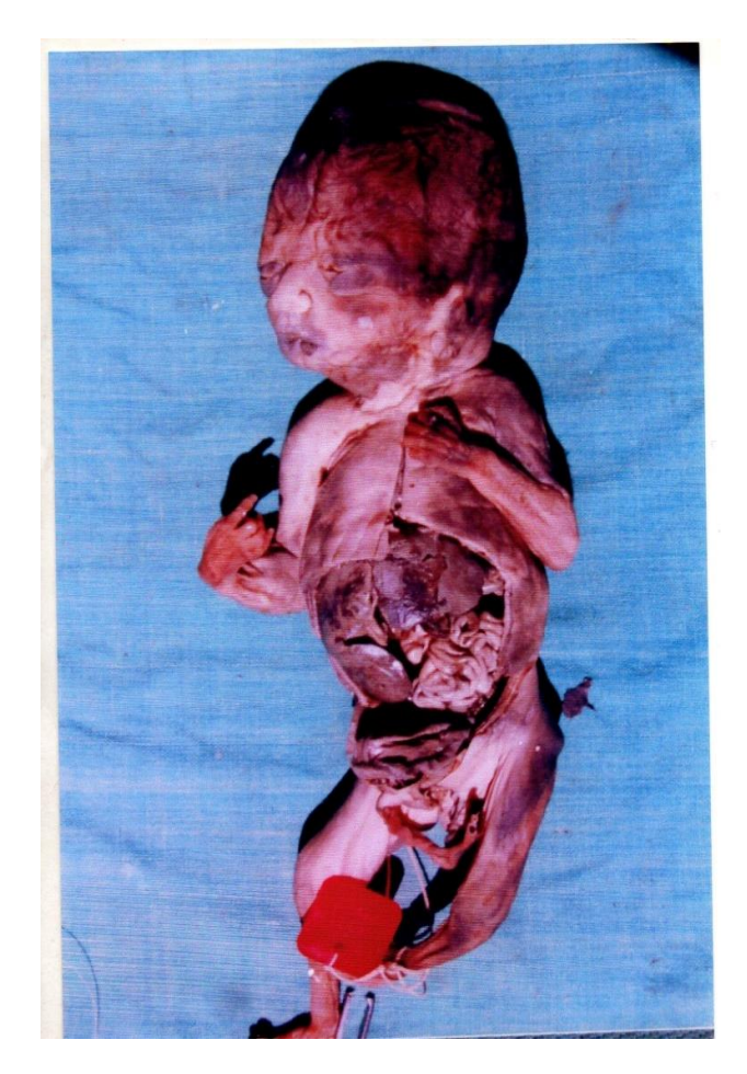
Figure 3: Bilateral hydronephrosis with dilated urinary bladder.

Figure 3 shows bilateral hydronephrosis with dilated urinary bladder.