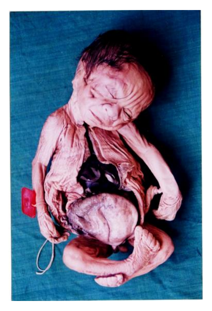
Figure 2: Prune belly syndrome: common cloaca.

Case No. 3: A still born male baby weighing 1.4 kg was born to 22 year old gravida 3, para 1 abortion 1, living 1 at 28 weeks of gestation. There was no h/o consanguinity. U/S report was hydronephrosis with gross dilatation of urinary bladder (common cloaca). Autopsy revealed, bilaterally enlarged kidneys, very much dilated urinary bladder, undescended testes and high ano rectal anomaly and urethral stenosis. All features were suggesting Prune belly syndrome.