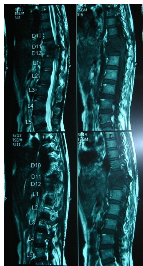
Figure 3: Spinal imaging (MRI) showing vertebral destruction at D11-12.

X-ray imaging showed destruction of D11 and D12 vertebra (Figure 3), which was confirmed on spinal MRI. Neurosurgeon's opinion was taken who later operated on her and laminectomy at D11-D12 and L1 with pedicle screw fixation was done successfully. Per operatively a lot of granulation tissue and extra-medullary pus were found which on histology showed smear of bone with inflammatory cell infiltrate along with epithelioid cells and necrosis highly suggestive of Pott's spine. After surgery lower limb power improved to grade-III and she was again started on anti-tubercular treatment category-II Ante-Tubercular Therapy (ATT) in a fairly good condition.