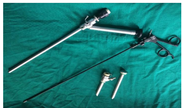
Figure 1: Karl storz rigid thoracoscope, trocars and biopsy forcep.

Medical Thoracoscopy was done in these enrolled patients using Karl storz rigid thoracoscope (Figure 1) and endoscopy system under local anesthesia in endoscopy room.