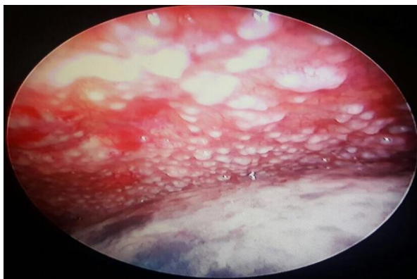
Figure 2: Multiple nodules seen on thorascopy.