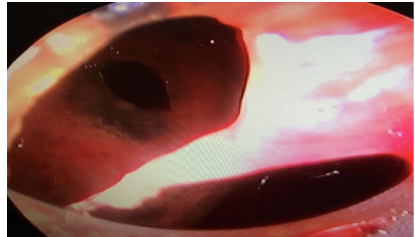
Figure 4: Adhesions on thorascopy.

Normal pleuron was seen in 16.7 %. Single nodule (Figure5) was found in 1 patient (3.3%) (Table 2).