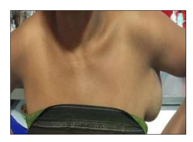
Figure 2: Photograph showing a large left axillary swelling and normal right axilla.

Ultrasound and Elastography was done using Ge Logiq S8 curvilinear and linear probes of frequency 3-5MHz and 9-12MHz respectively.