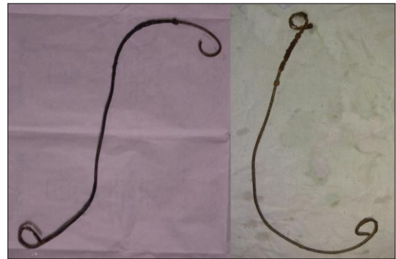
Figure 2: Encrusted DJ stent.

guidance. Other patients underwent procedures such as Cystolithotripsy, URSL and PCNL (Table 6).