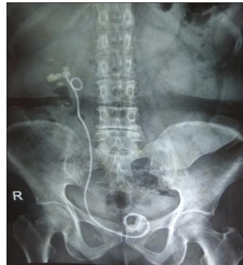
Figure 1: X-Ray KUB showing Stone along the DJ stent.

Nephrectomy was considered if the stented kidney was non-functional.