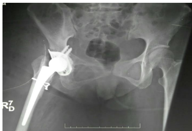
Figure 4: Post-operative pelvic X-Ray of the patient after total hip replacement.