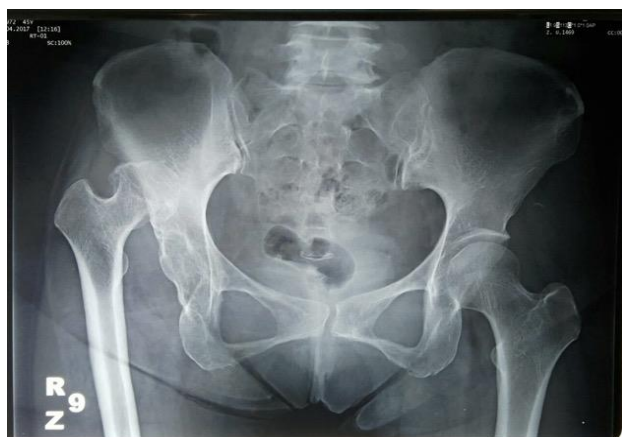
Figure 1: Pre-operative x-ray of the pelvis, showing neglected right posterior hip dislocation.

Authors saw this patient 30 years after the initial injury, complaining of hip pain and limping gait. She was walking with antalgic gait and had a decreased range of motion of her right hip. She had a leg length discrepancy due to 5 cm shortening of right lower extremity. Her hip joint movements were restricted, but not painful. Radiographs confirmed a persistent dislocation of the right hip, with a pseudo-acetabulum in the right supra-acetabular region (Figure 1).