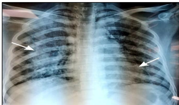
Figure 1: The chest X-ray on I-day (admission) showed minimal bilateral infiltrates.

complaint fever, cough, dyspnea and chest pain for 5 days prior to admission. No closed contact with a COVID-19 patient, had a history of penicillin allergy.